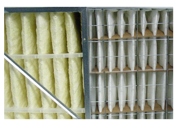
Plastic (left) and cardboard (right) finger media separators