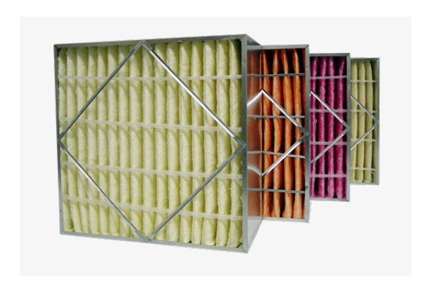
Tri-Cell R filters (left to right) 45-45%, 60-65%, 80-85% and 90-95%