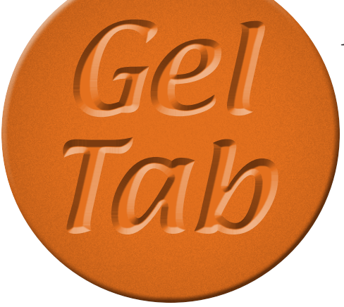
20 ton Tab - 4185-20