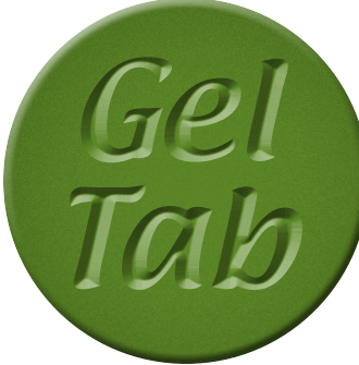
15 ton Tab - 4185-15