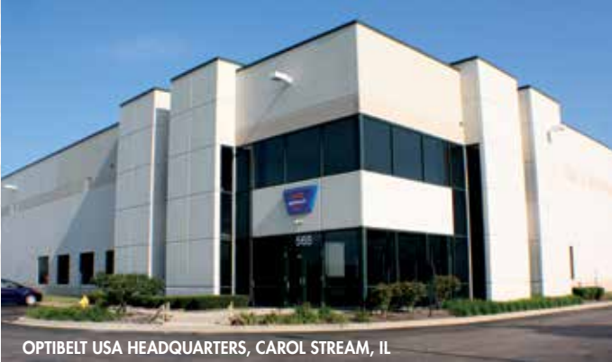
OPTIBELT USA HEADQUARTERS, CAROL STREAM, IL